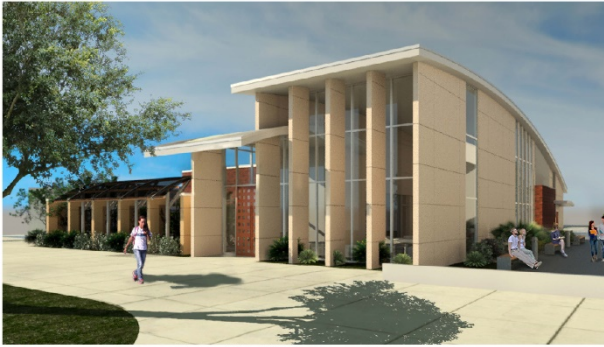
Bakersfield College Vernon Valenzuela Veterans Resource Center

This year, our campus is especially excited for the grand opening and ribbon cutting of the Vernon Valenzuela Veterans Resource Center on December 10, 2019.