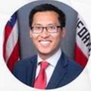
Vince Fong Assemblymember, 34 th District