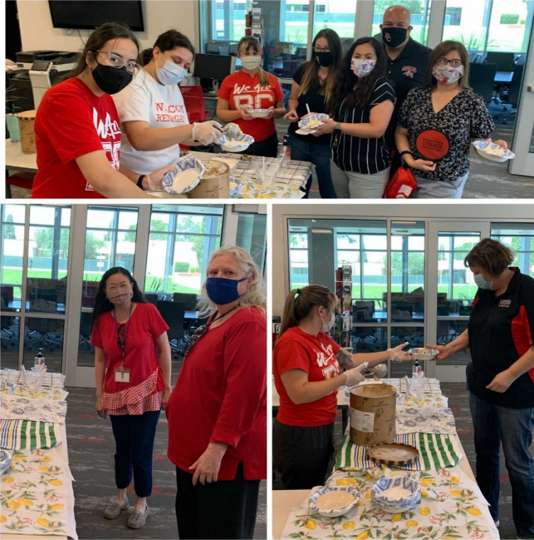
BC showed classified staff their appreciation with an ice cream social.

The dedication, perseverance and initiative of BC's classified staff are the core of our campus. You are our educational advisors who skillfully guide our students on the educational pathway. You are our campus safety officers who keep an eye out for the wellbeing of our students. You're our maintenance and operations staff who meticulously care for our facilities and educational spaces. You're our office support members who schedule meetings and make sure all of the college's necessary paperwork is taken care of. You are among the very first representatives of the BC community that our students meet, and your warmth and kindness are what invites them to join the Home of the Renegades.