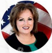
Shannon Grove California State Senator