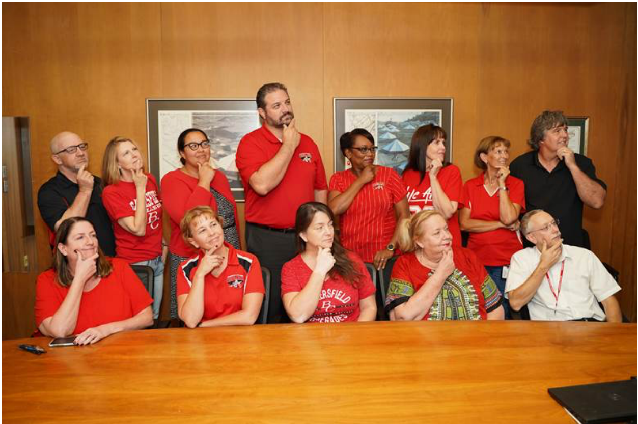
BC's Budget Committee

Unless we get this globally under control, there is a very good chance that it will assume a seasonal nature in the sense that if - and I hope it's not only if but when - we get it down to a point where it is really at a low level, we need to be prepared. Since it will be unlikely to be completely eradicated from the planet, as we get into next season, we may see the beginning of a resurgence. -Dr. Fauci, April 5, 2020