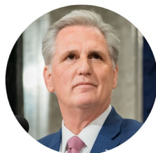
Kevin McCarthy U.S. Congressman & House Minority Leader