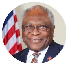
Jim Clyburn U.S. Congressman & House Majority Whip