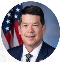
TJ Cox U.S. Congressman