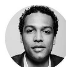
Justin Worland Writer, Time Magazine BAKERSFIELD COLLEGE