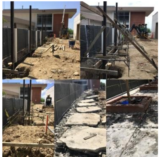
Construction taking place on the Veterans Resource Center