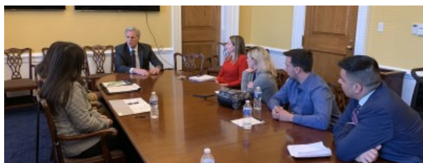
BCSGA Officers speak with Congressman Kevin McCarthy in his Washington, DC Office.

The ASACC also provided the opportunity for BC's students to speak with representatives from Congress Member Barbara Lee's Office, Congress Member Garamendi, and Congress Member, Kevin McCarthy.