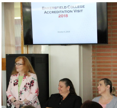
Photo: Chancellor Kathleen Burke stands at the formal Exit Report in Oct. 2018

Bakersfield College received zero recommendations for compliance and zero recommendations for improvement, a rare feat in higher education. The full accreditation report for Bakersfield College is available to the public and is posted on the institutional webpage.