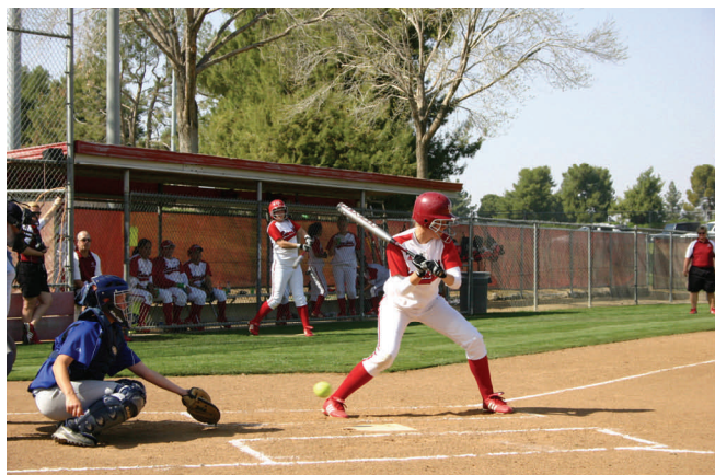
Women's Softball Team

2nd in regular season play, and began their playoff run on May 5. The men's baseball team continues with a strong season.